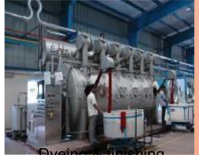
Dyeing & finishing

We do from our own local & imported sources.